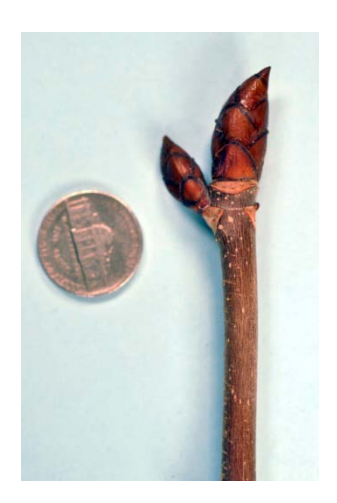
Terminal bud of Common Horsechestnut