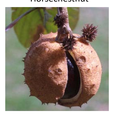
Fruit of Ohio Buckeye

4) Terminal bud covered in short hairs (velveteen) and chocolate to dark brown. Dry fruit with single wing (single samara)