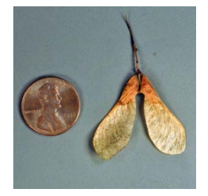
Double samara fruit of Maples (Note: size of fruit and angle of wings varies with species).