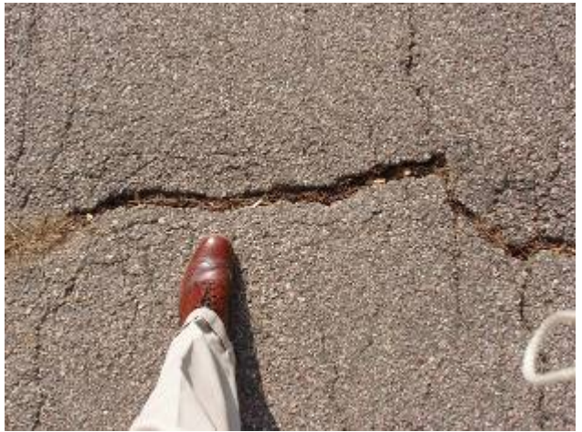
Kensington/Countryside Greenbelt Trail