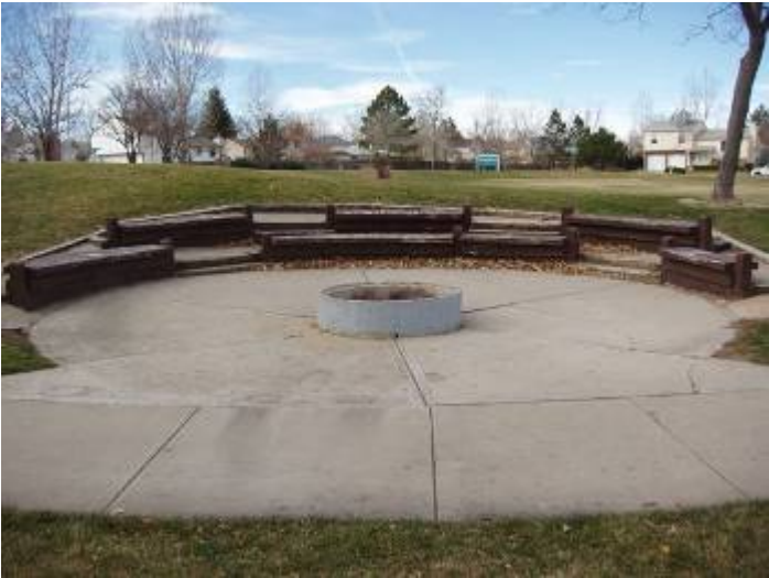
Kensington Park Amphitheatre and Fire Ring