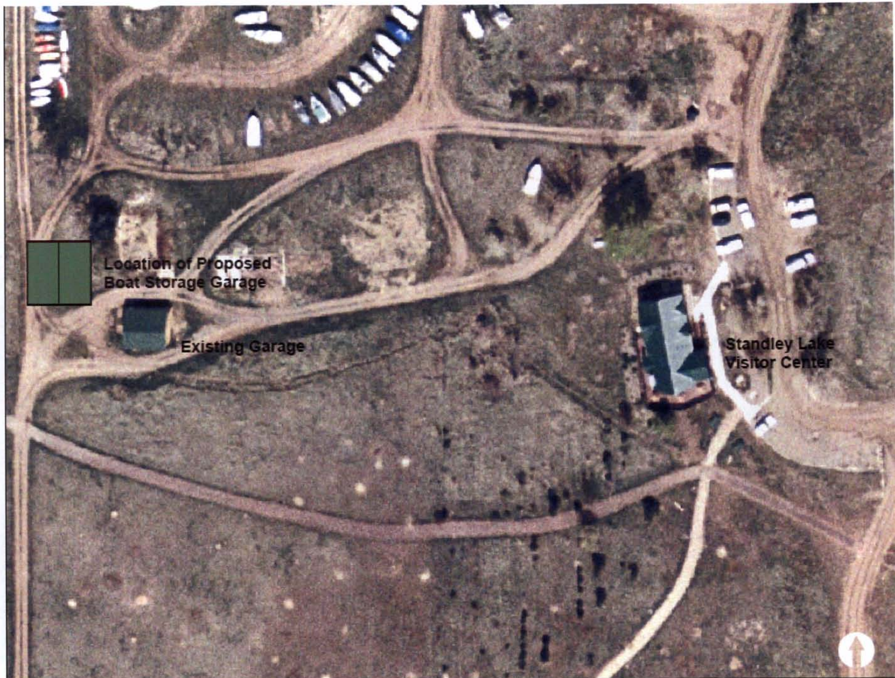
Standley Lake Boat Storage- Location Map